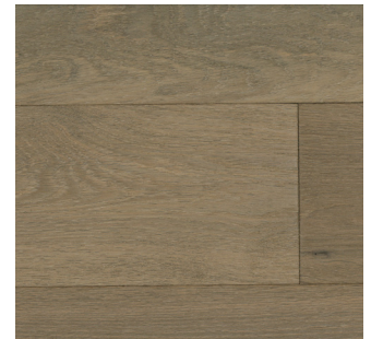
Northern Lights (Oak)