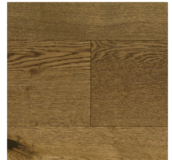
Canora Harvest (Oak)