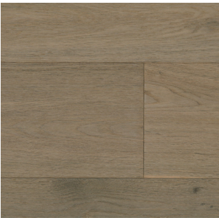
April Snow (Oak)

Chock full of value, this 9/16" x 6" wide plank white oak T&G product is available in 9 of the most popular colours currently being sold. With planks up to 73" long, a 3mm sawn wear layer, and a wire brushed matte finish, it is suitable for the most active areas of the home.