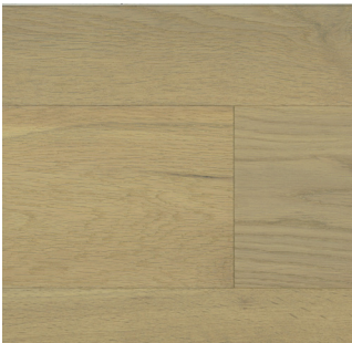
Honey Wheat (Oak)