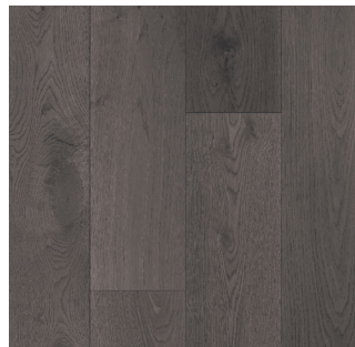
Ettiquette (European Oak)