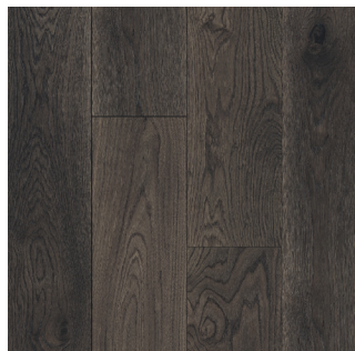
Queen Mary (European Oak)