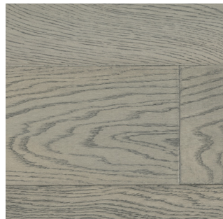
Carriage House (European Oak)