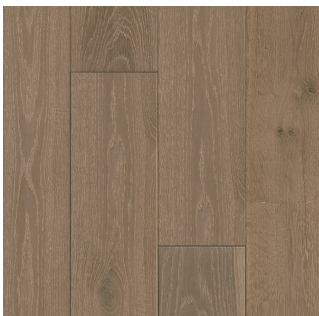
Memento (European Oak)

Creating a romantic setting with the Casa Loma collection reflects current trends and modern creativity which invites warmth, exudes style and a calming effect for your home. Perfect for many decorating styles that evoke images of traditional and nostalgic luxury.