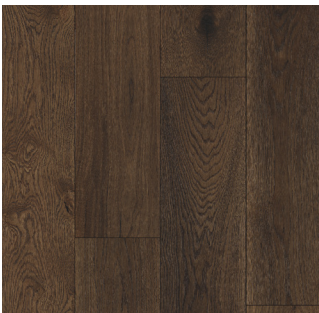
Great Hall (European Oak)