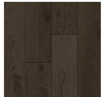
Stable (European Oak)